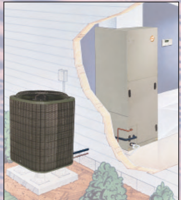
Heat Pump and Fan Coil System

Payne always recommends replacing the fan coil when purchasing a new heat pump. Most likely, the fan coil is as old as the heat pump you are replacing, thus reducing the efficiency of the new unit. The older fan coil could contain dirt or other contaminants that would be harmful to the new model. And, the old fan coil may not properly match the new heat pump. Buying a new fan coil also means your entire system will be covered with new product warranties.